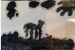
1. Prehistoric Cave Art (Pre K- 6th grade)