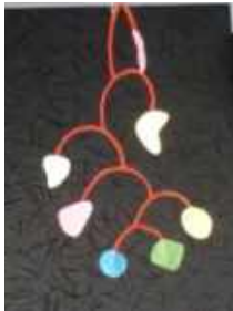
5. Calder mobile (Pre K - 2nd grade)