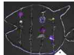
6. Calder Wire sculpture (3rd - 6th grade)