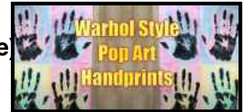
4. Pop Art Hand-Print Painting (Pre K - 2nd grade)