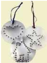
3. Pioneer Tin Punching (3rd - 6th grade)